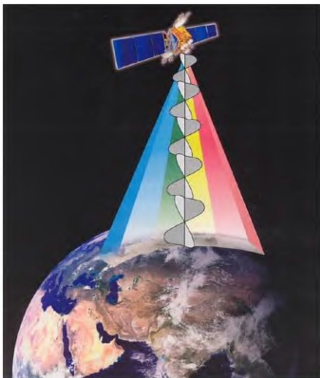
Figure 3. A conceptual sketch of operation of the proposed sensor.

1. Three cases are shown. Figure 1a shows simulated radiance image for a nadir-looking sensor at typical atmospheric conditions. Here, an aerosol image (for January 2001) has been superposed over the continent with known surface reflectance. The large radiance value over Sahara is due to high reflectance of the desert. This is a conventional case where radiance signal from the surface is much larger compared to aerosol back-scattered signal. In this case, it is difficult to retrieve aerosol information. In Figure 1b, we show the same sensor looking at angle of 45^\circ with respect to local normal. It can be seen that surface reflection effect is less compared to the nadir case. This is because of larger atmospheric path length in this case. In Figure 1c, we show the same sensor looking at angle of 45^\circ and receiving polarized signal. Here, surface reflection effects are minimum. The features visible are mainly due to atmosphere and not due to surface reflection. This case is