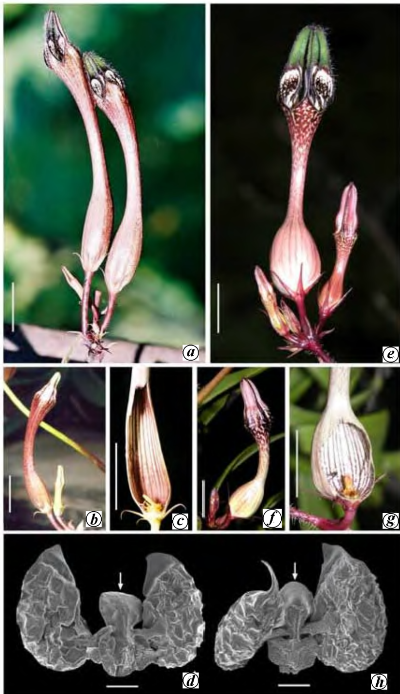
—d. Ceropegia oculata var. satpudensis Puneekar et al. a, Flower; b, Flower bud; c, Base of corolla tube cut open to show window bands and corona; d, Pollinarium (arrow showing truncate corpuscle head); e–h, Ceropegia oculata Hook. var. oculata . e, Flower; f, Flower bud; g, Base of corolla tube cut open to show window bands and corona; h, Pollinarium (arrow showing obtuse corpuscle head). Scale bars: a–c, e–g = 1 cm; d, h = 100 \mu m.

A tuberous twining herb. Tuber 2–4 cm across, depressed globose. Stem unbranched c. 50–70 cm long, terete, striate, glabrous, purplish in older part, greenish in younger. Leaves opposite; petioles 1.2–3 cm long, channelled, glabrous; lamina elliptic-lanceolate, up to 14 cm long and up to 5.5 cm in breadth, base rounded, truncate or cuneate, apex caudate, acumen curved, sparsely hairy above and on the nerves beneath, margin ciliolate; secondary nerves 5–6 pairs, curving upwards, looping along the margin, lower pair of nerves emerging from leaf base. Flowers in axillary, peduncled, 2–4-flowered umbellate cymes; peduncles hirsute up to 7 cm long; bracts subulate, up to 4.5 mm long, glabrous, scarious along margins, pale pink; pedicels terete, hairy or glabrescent, pink, grooved, 1–2 cm long. Calyx five-partite, lobes subulate, c. 5 mm long, glabrous or rarely sparsely hairy, three-nerved, tips often recurved. Corolla up to 6 cm long, slightly curved; tube up to 5 cm long, up to 4 mm across in the middle, funnel-shaped at apex, glabrous at mouth, uni-