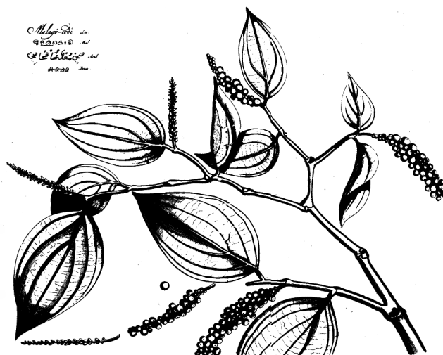
A twig of black pepper, Piper nigrum , reproduced from figure 12 in vol. 7 of Hortus Malabaricus showing young and old spikes bearing flowers and fruits.

speciosus , Amorphophallus paeoniifolius , Colocasia esculenta , Lagenandra ovata , Nymphaea pubescens , Nelumbo nucifera , Pistia stratiotes , Ipomoea quamoclit . Volume 12: Rhynchosstylis retusa , Diplazium esculentum , Raphidophora pertusa , Lygodium flexuosum , Lycopodiella cernua , Saccharum spontaneum and Fimbristylis argentea .