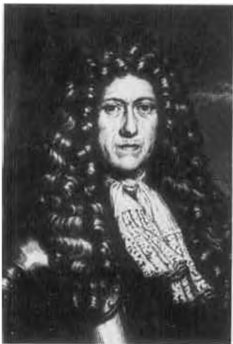
Hendrik Adriaan Van Rhee de tot Draakenstein (1636–1691).

the Dutch East India Company. From Portuguese, the text was rendered into Dutch and thence to Latin. The introductions, forewords and dedications given separately in various volumes also contain valuable insights into the cultural, social, political, historical and linguistic conditions of 17th century Malabar.