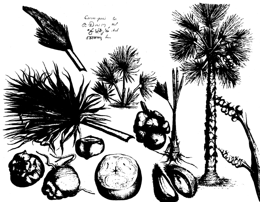
Figure 9 in vol. 1 of Hortus Malabaricus depicting young and adult female plants of palmyra palm, Borassus flabellifer . Also shown are leaf, young inflorescence, flowers, whole fruits and cross-section of fruit.