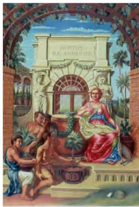
Frontispiece of Hortus Malabaricus .