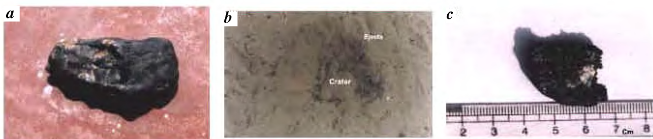
Figure 2. a, The 2.5 kg Bhuka meteorite showing regmaglypts on well-developed fusion crust. b, Crater (about 45 cm deep) and its ejecta produced by fall of the meteorite in sandy alluvium field. c, Fragment showing presence of white silicate inclusions.