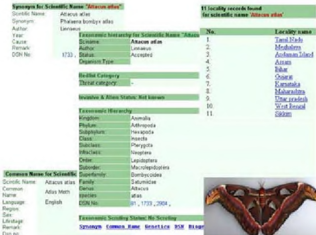
Figure 5. Query results through query/search module of IndFauna.