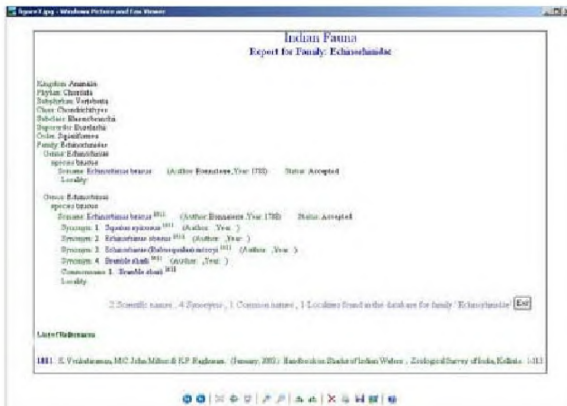
Figure 7. Taxon editors report module of IndFauna.