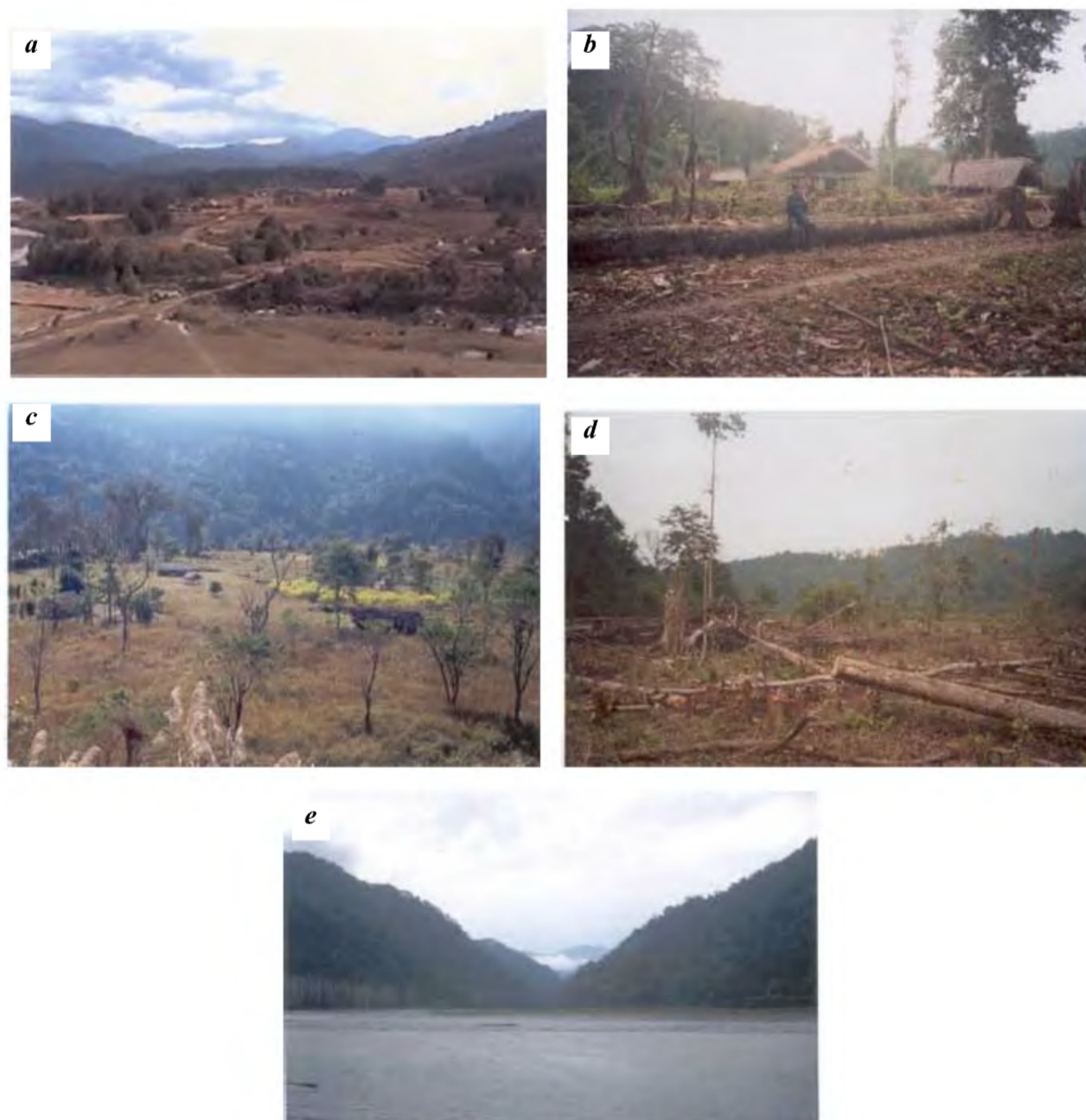
Figure 1. Human disturbances in Namdapha nature reserve. Settlements in southeastern boundary (a), core zone (b) and northwestern boundary (c). d, Clear-felling in core zone. e, Overview of Namdapha.

well as from civil administration. Quantification of the extracted forest products was done by weighing the head load and quantity consumed per household per day in the sample households.