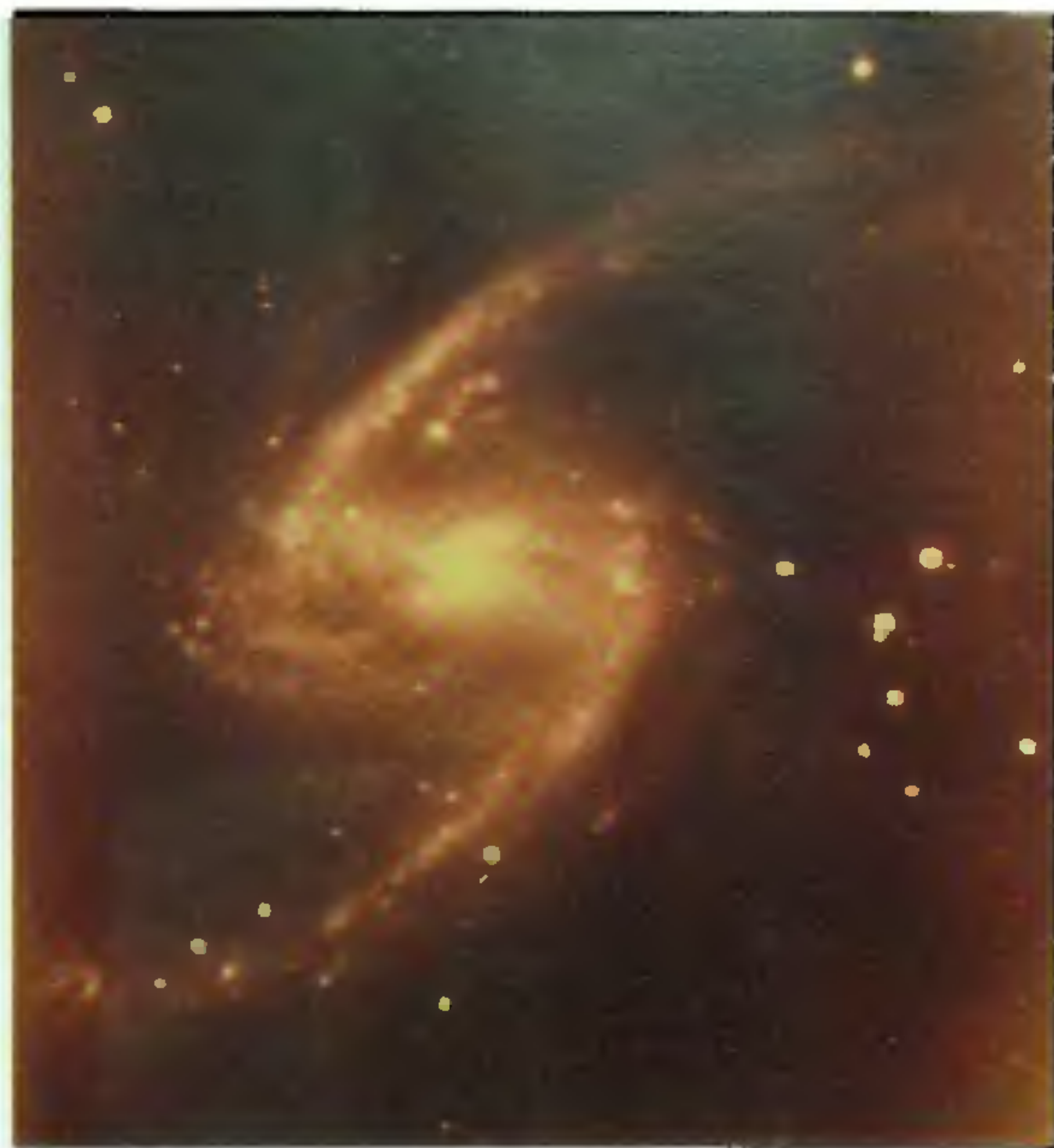
A BVR composite image of the barred spiral NGC 1365. (234 cm photograph)