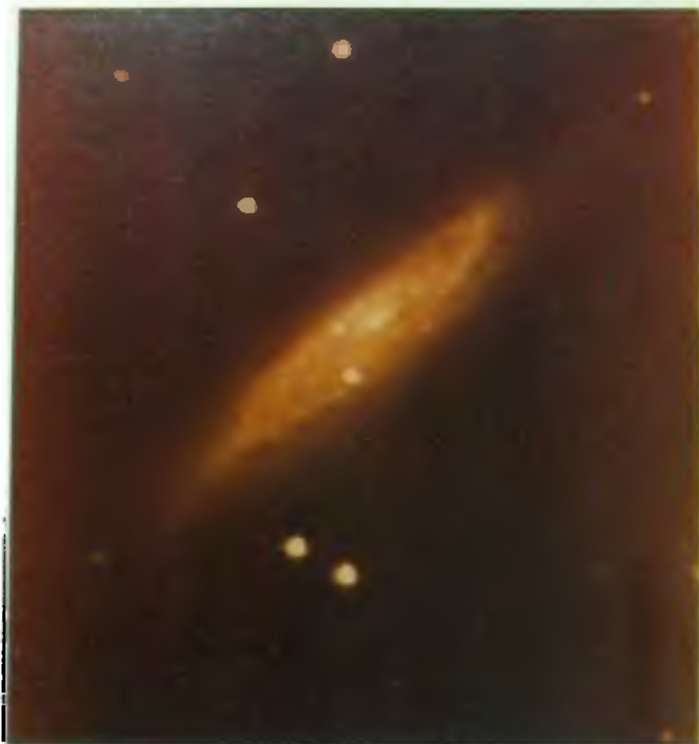
A BVR composite image of the infrared luminous spiral NGC 7817. (234 cm photograph)