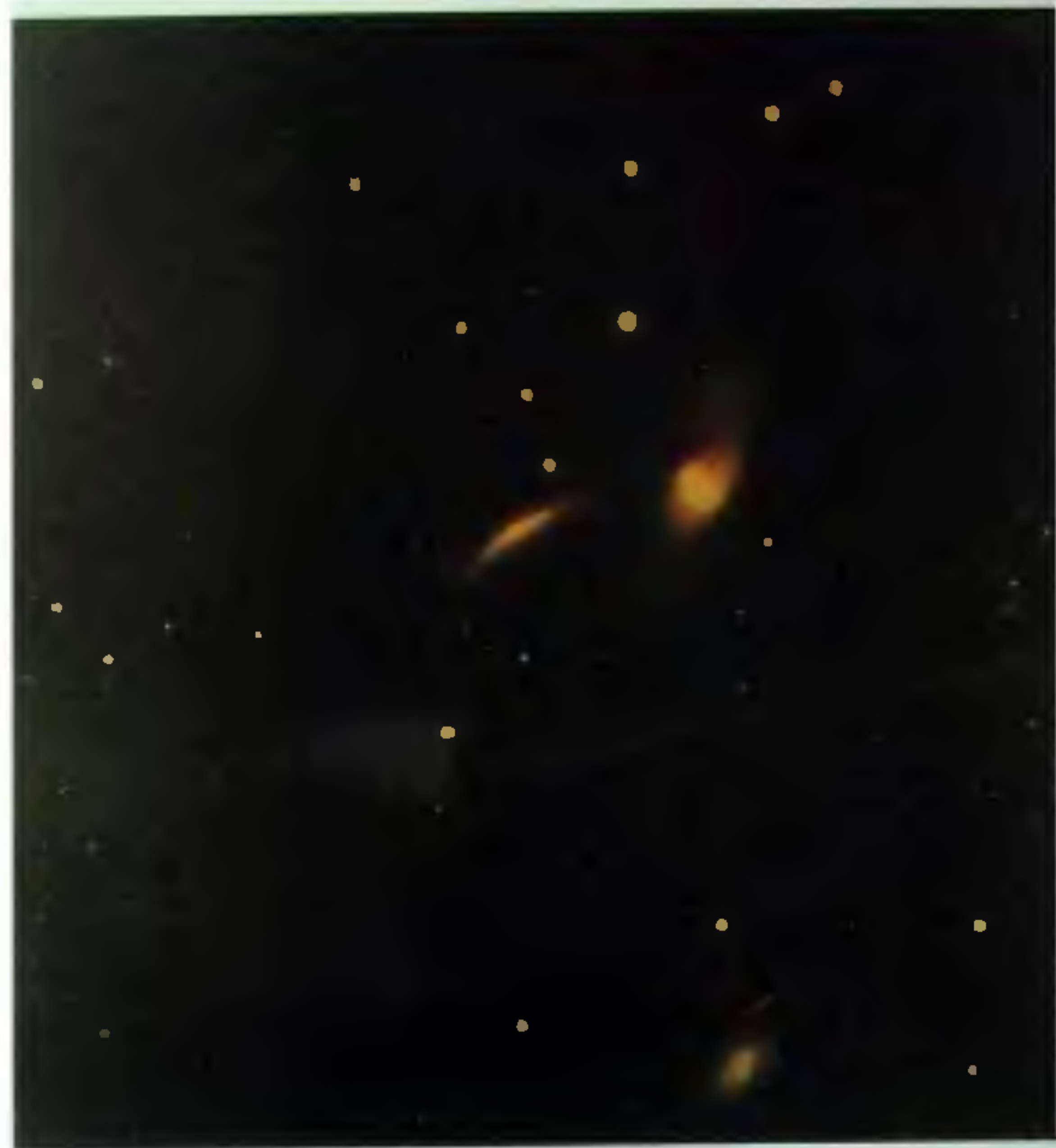
The interacting galaxy NGC 2798 in BVR. (234 cm photograph).

which was commissioned during 1974. With slight modifications this coudé echelle spectrograph is still very much in use today. The helium line profiles obtained at a reciprocal dispersion of 4.8 \text{ \AA/mm} allowed a comparison between theoretically computed LTE and non-LTE profiles and showed that the latter fitted the observations better. It also led Rajamohan to a determination of the helium abundance in the member stars of the association 6 . The rotational velocity data were utilized by Rajamohan to produce an important paper on stellar rotation on the zero-age main sequence 7 .