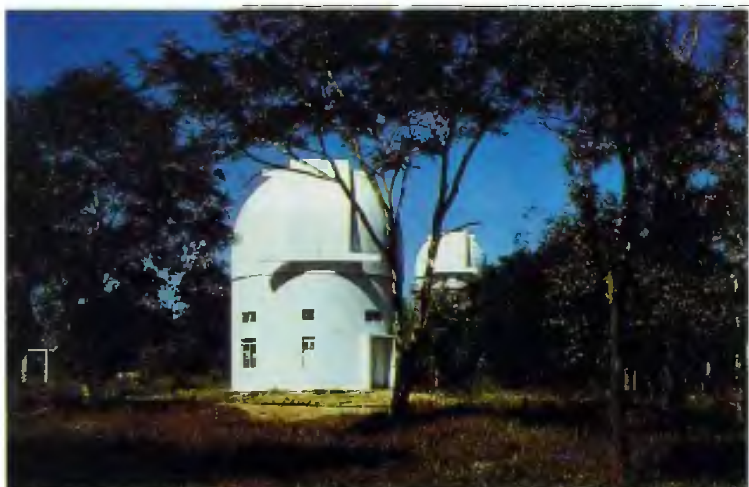
75 cm (30") telescope building in front and the 40" building in the background.