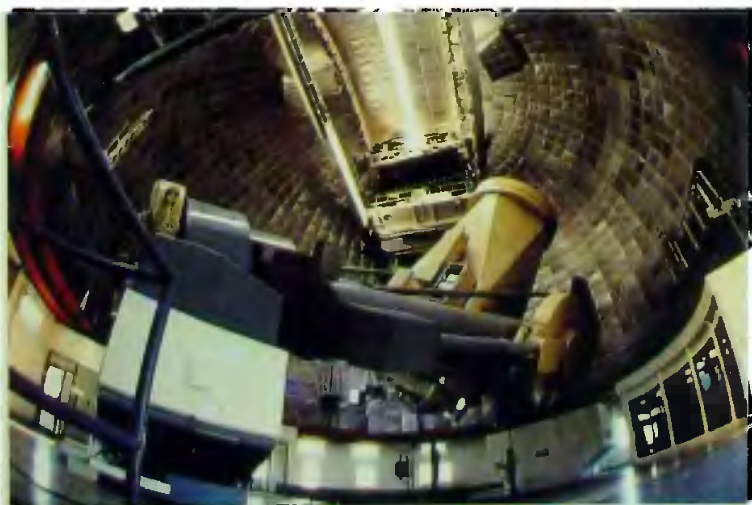
The 234 cm Valnu Bappu Telescope, an early photograph before the removal of the cover panels in 1989-90.