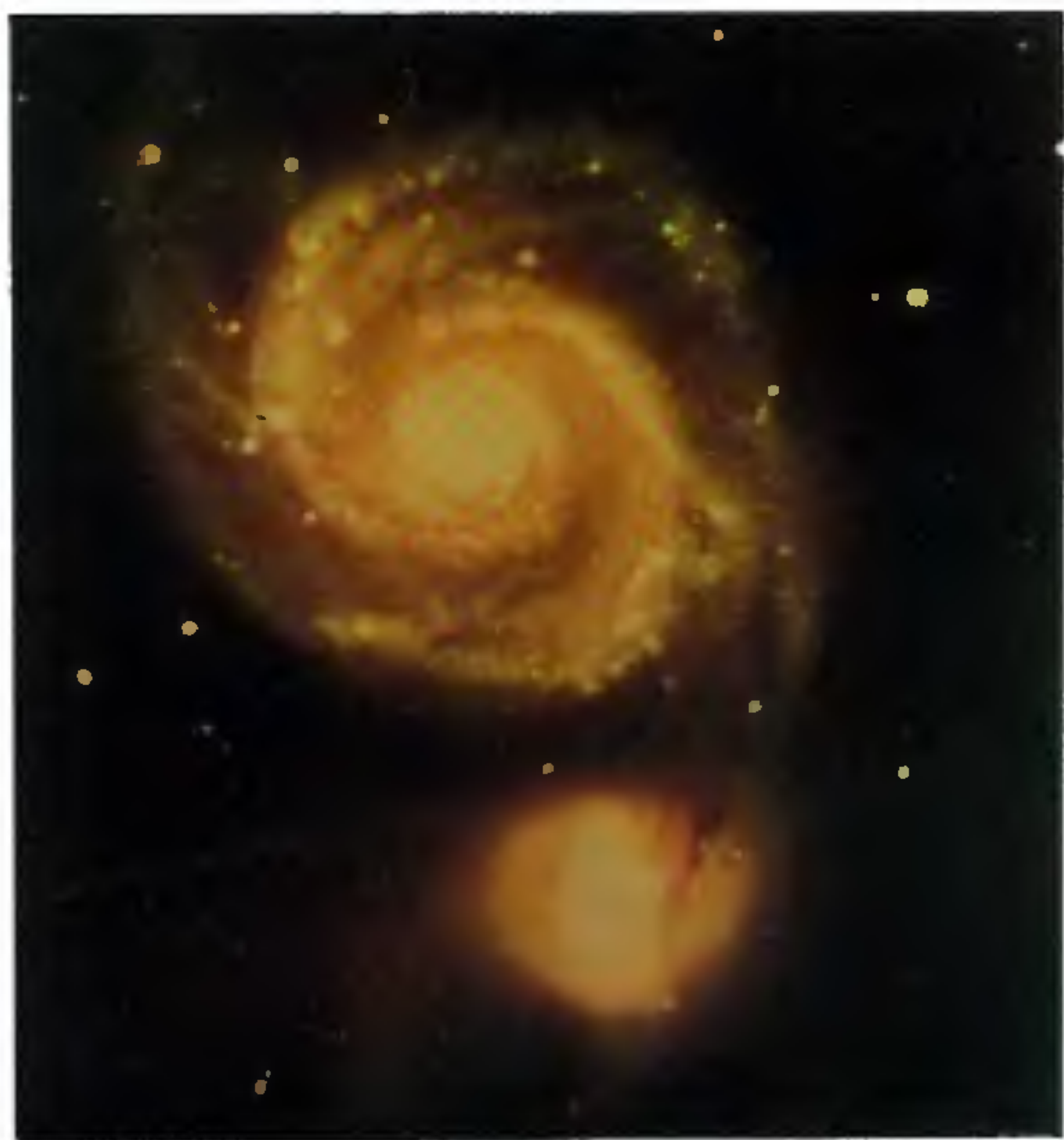
The Whirlpool galaxy M51/NGC 5194 in BVR. (234 cm photograph)