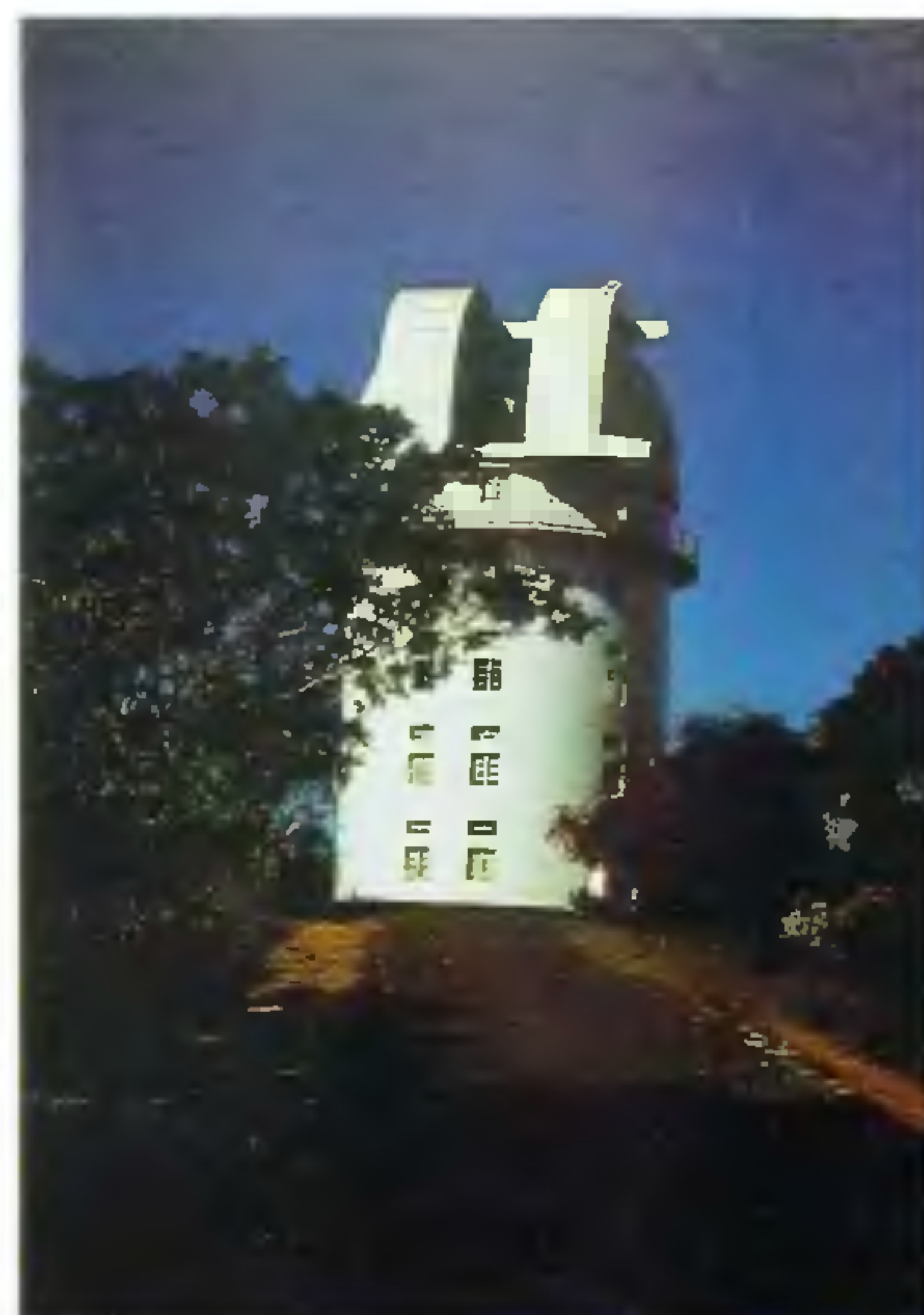
A view of the 40" reflector building with the dome shutter open.