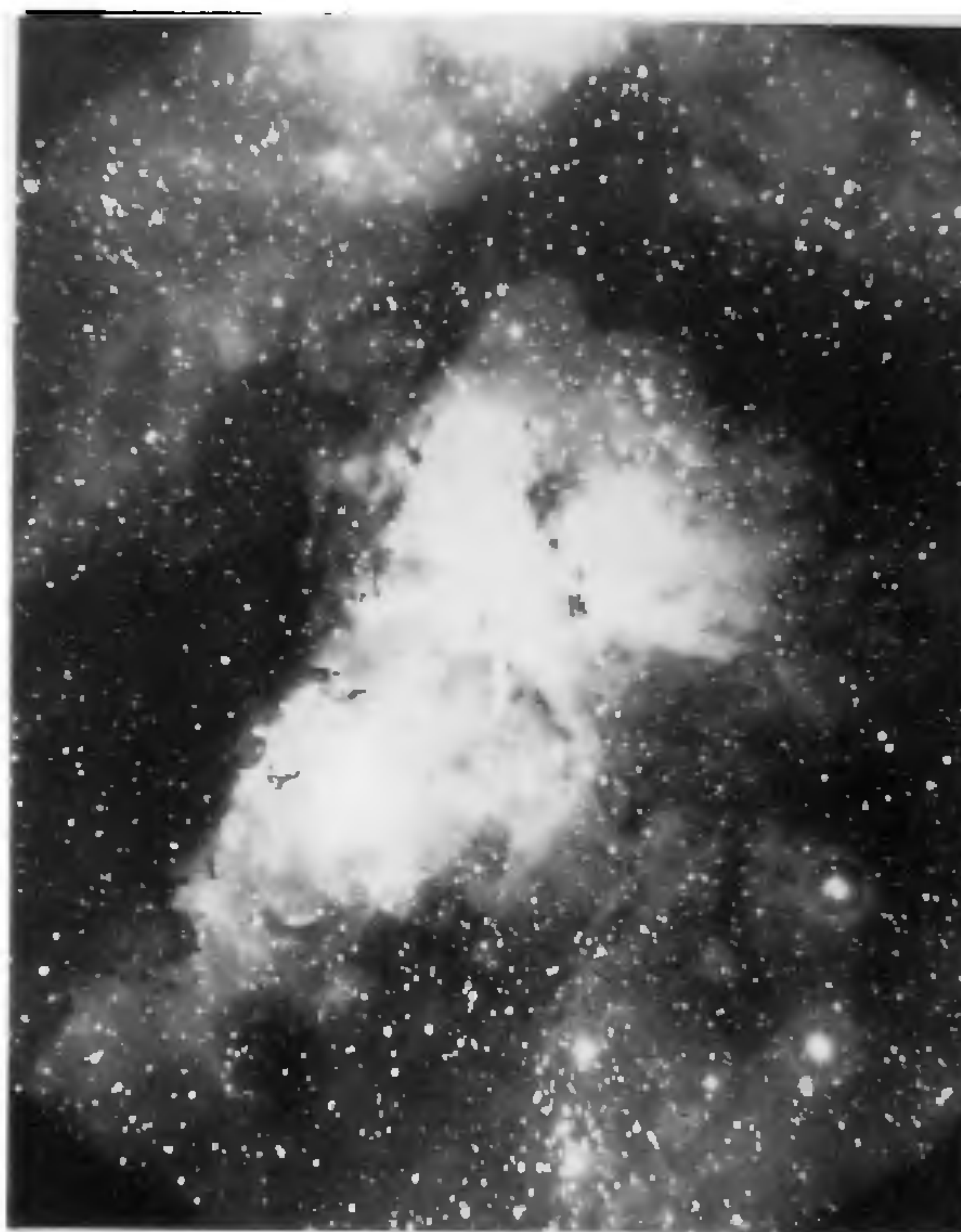
The Carina Nebula (102 cm photograph).