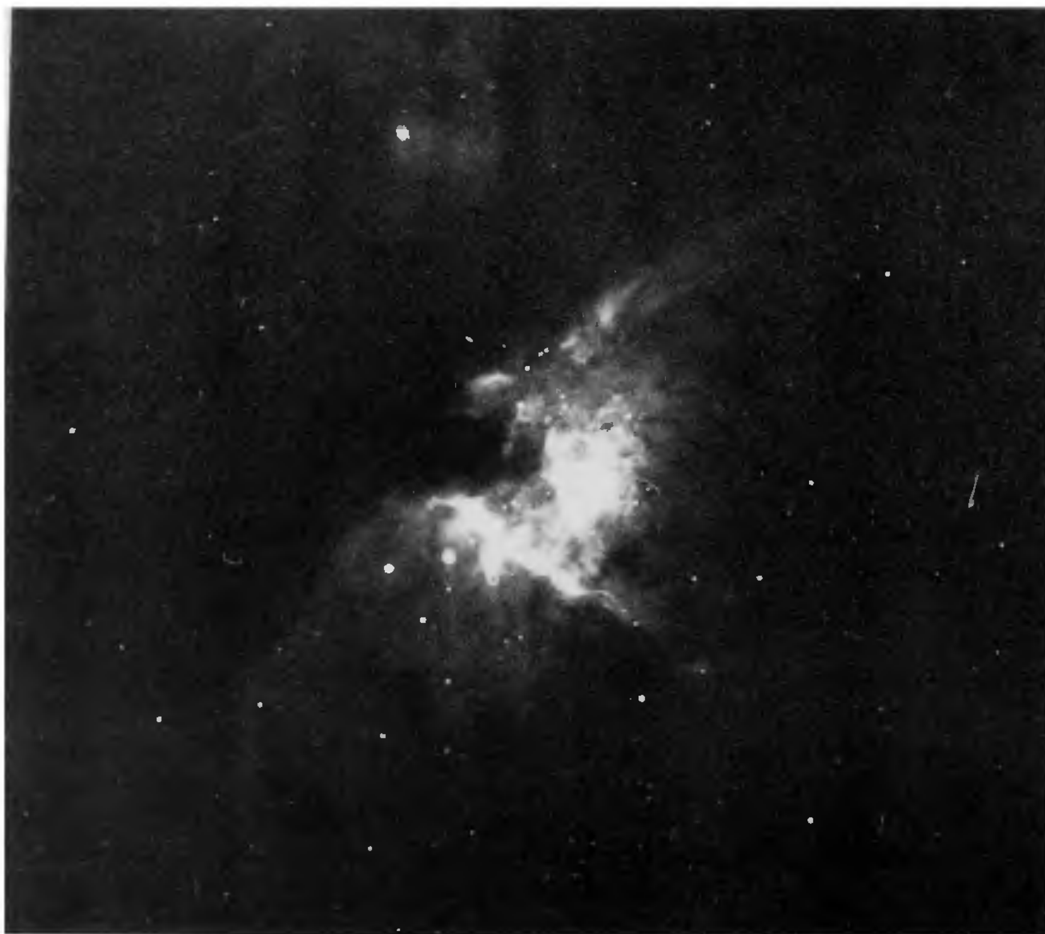
The Orion Nebula seen in the light of the forbidden S^+ doublet \lambda 6724 . (102 cm photograph)