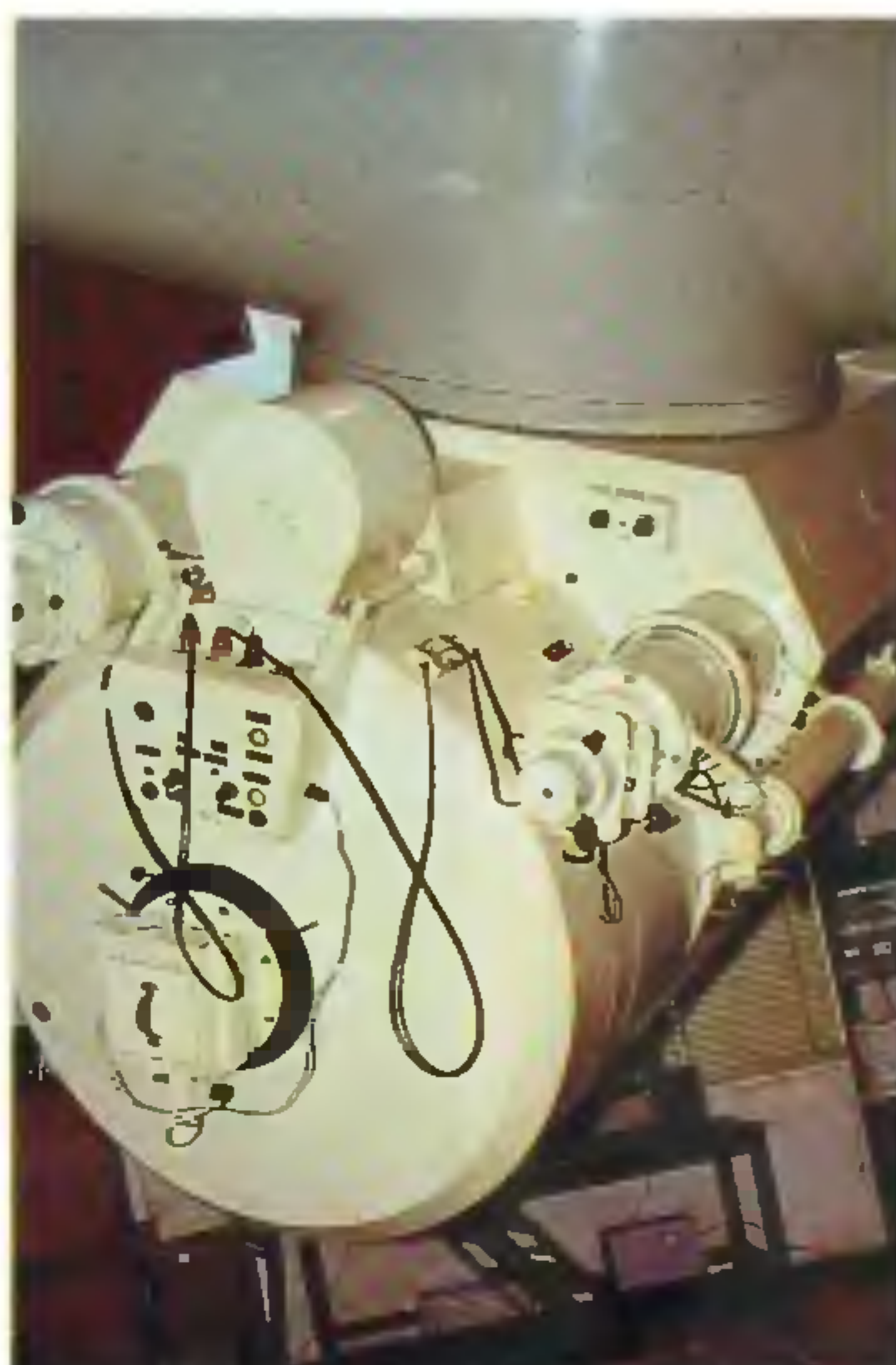
102 cm (40") Zeiss reflector.