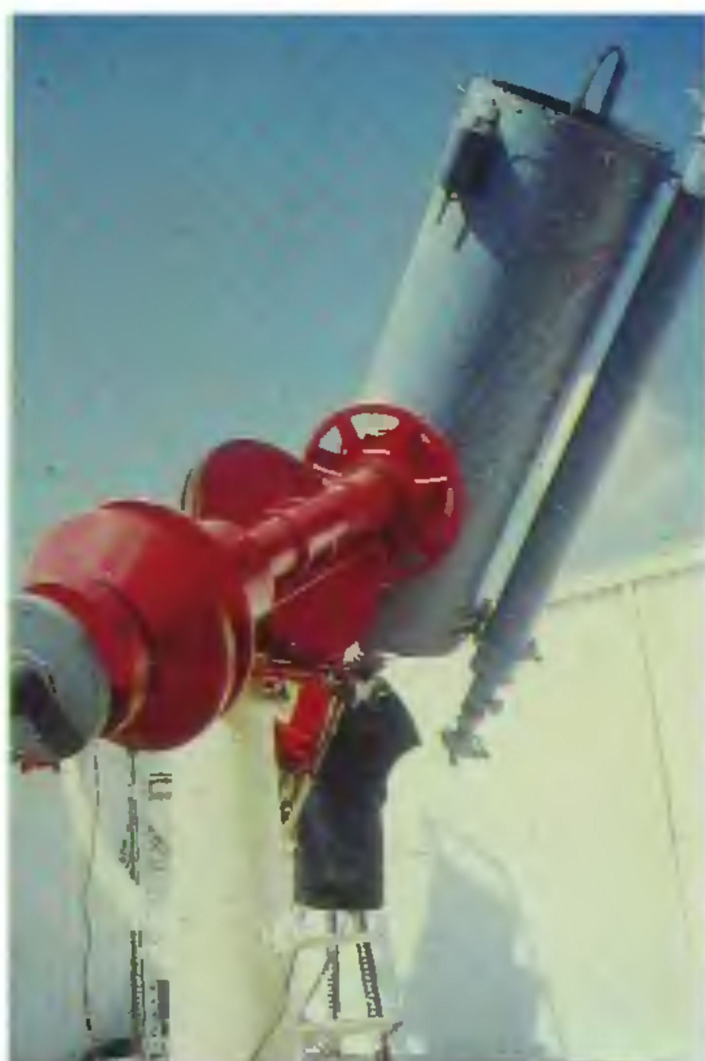
38 cm reflector, the first astronomical telescope in Kavalur.