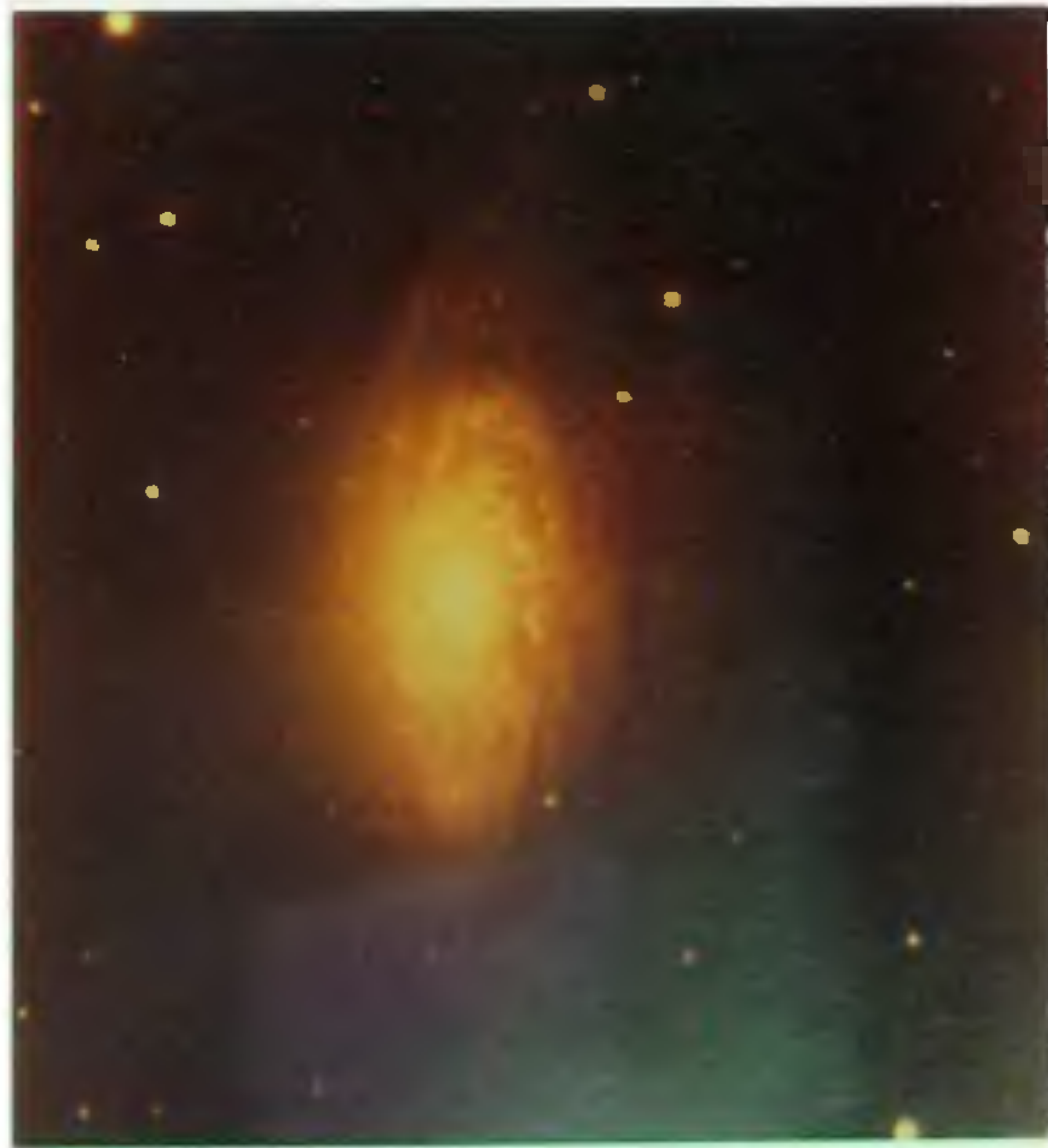
The infrared luminous spiral galaxy NGC 3521 in BVR. (234 cm photograph)