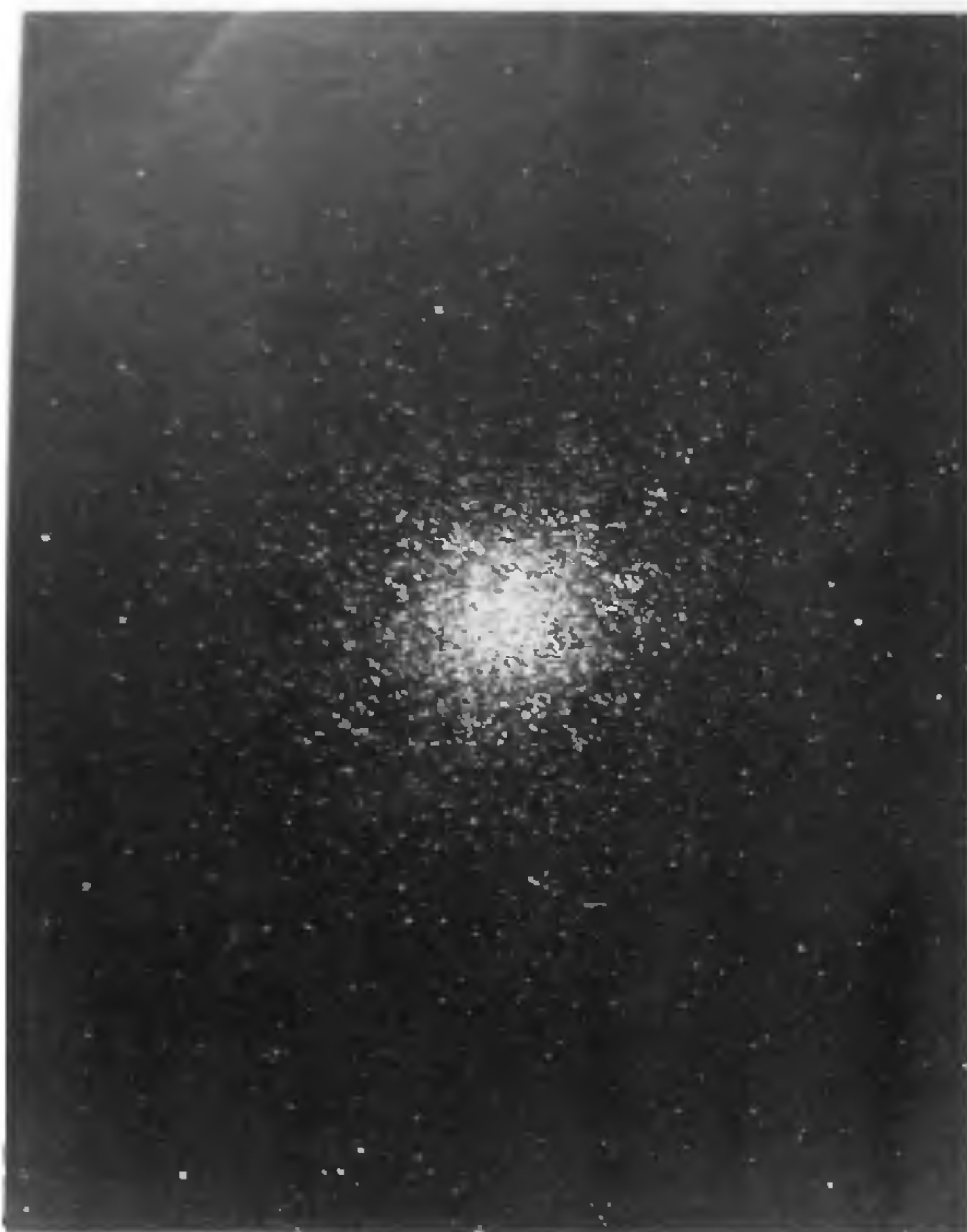
Omega Centauri, the Southern globular cluster. (102 cm photograph)