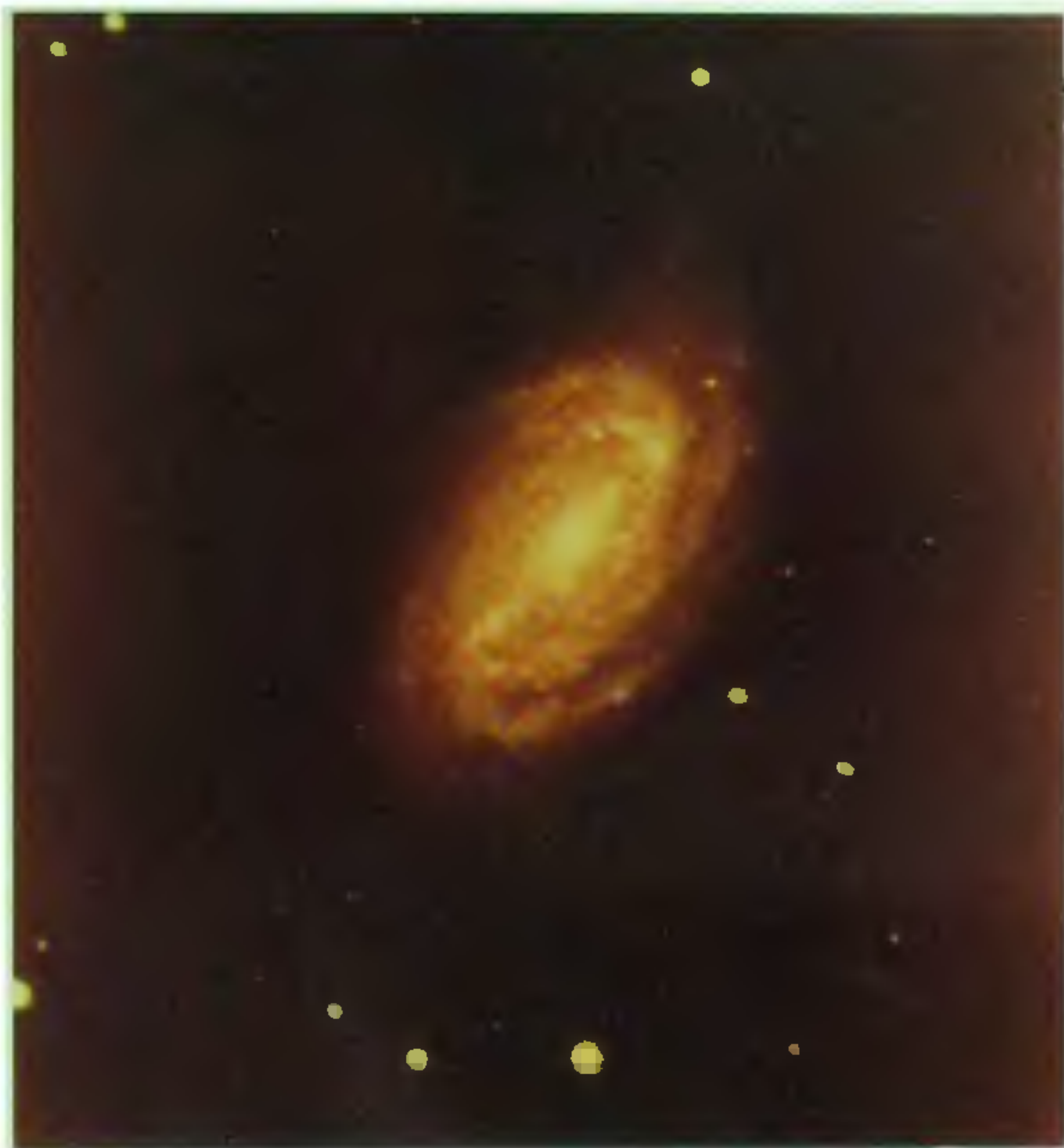
A BVR composite image of the galaxy NGC 2903. (234 cm photograph)