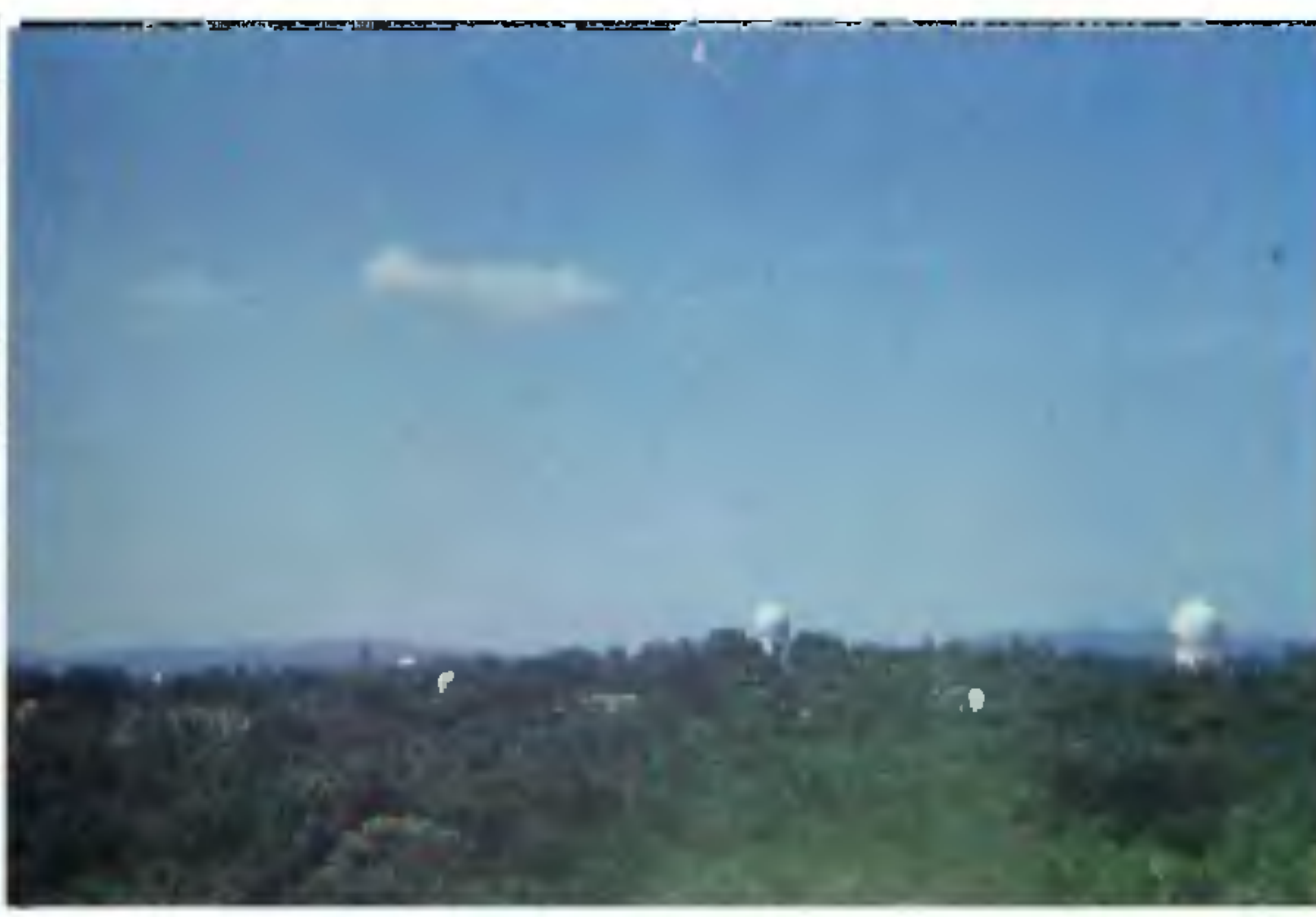
A panoramic view of Valnu Bappu Observatory, Kavalur.