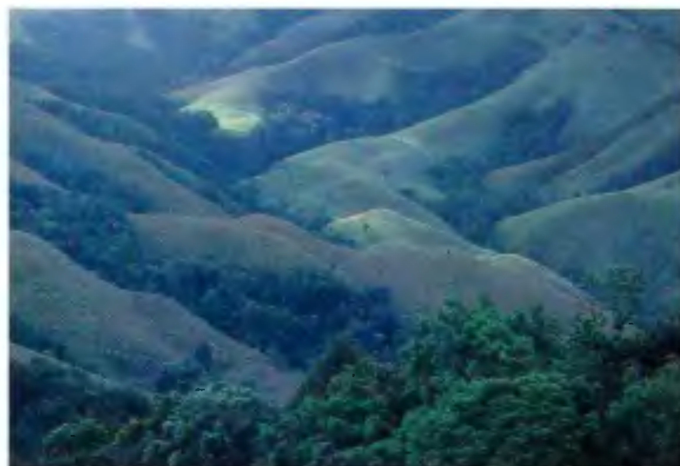
Typical shola vegetation of Western Ghats.