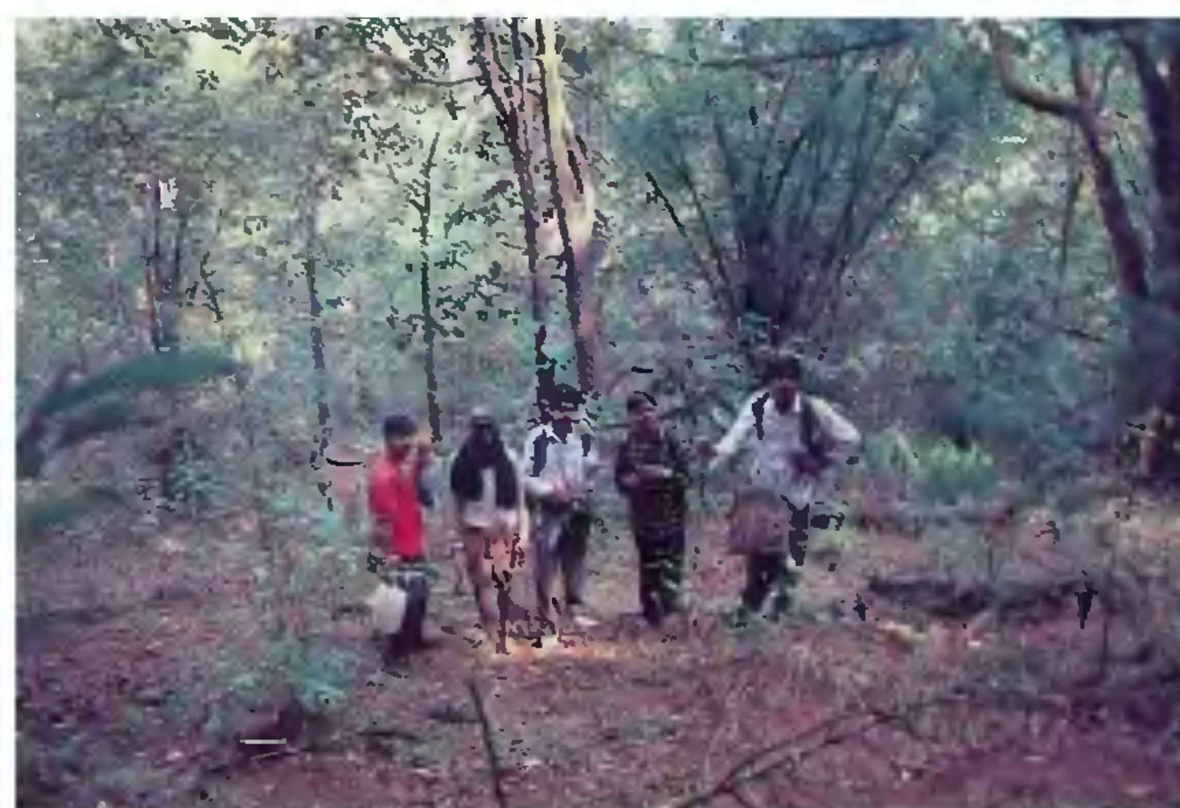
A network team from Bhadravathi engaged in field work in Narasimharajapura range forest of Chikmagalur district.

network covering the entire country. Such a network will have to be erected on two pillars; the large numbers of students and trained biologists working as teachers in undergraduate colleges throughout the country and the even larger number of practical ecologists – fisherfolk and shepherds, dispensers of herbal medicine and rat-catchers who depend on living resources for their livelihoods 14 . If mobilized such a group will not only generate valuable information, of both basic and applied interest but the process will also serve as an excellent tool of training in science.