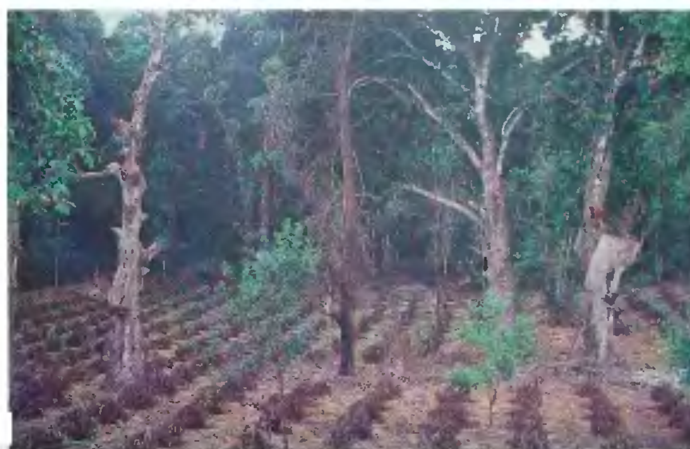
Encroachment – a common site.

Such a task cannot be carried out in a routine, centralized fashion for the ecological systems are highly variable in space and time, and must be investigated and more importantly managed in ways sensitive to this variation. So it is necessary to organize an effective