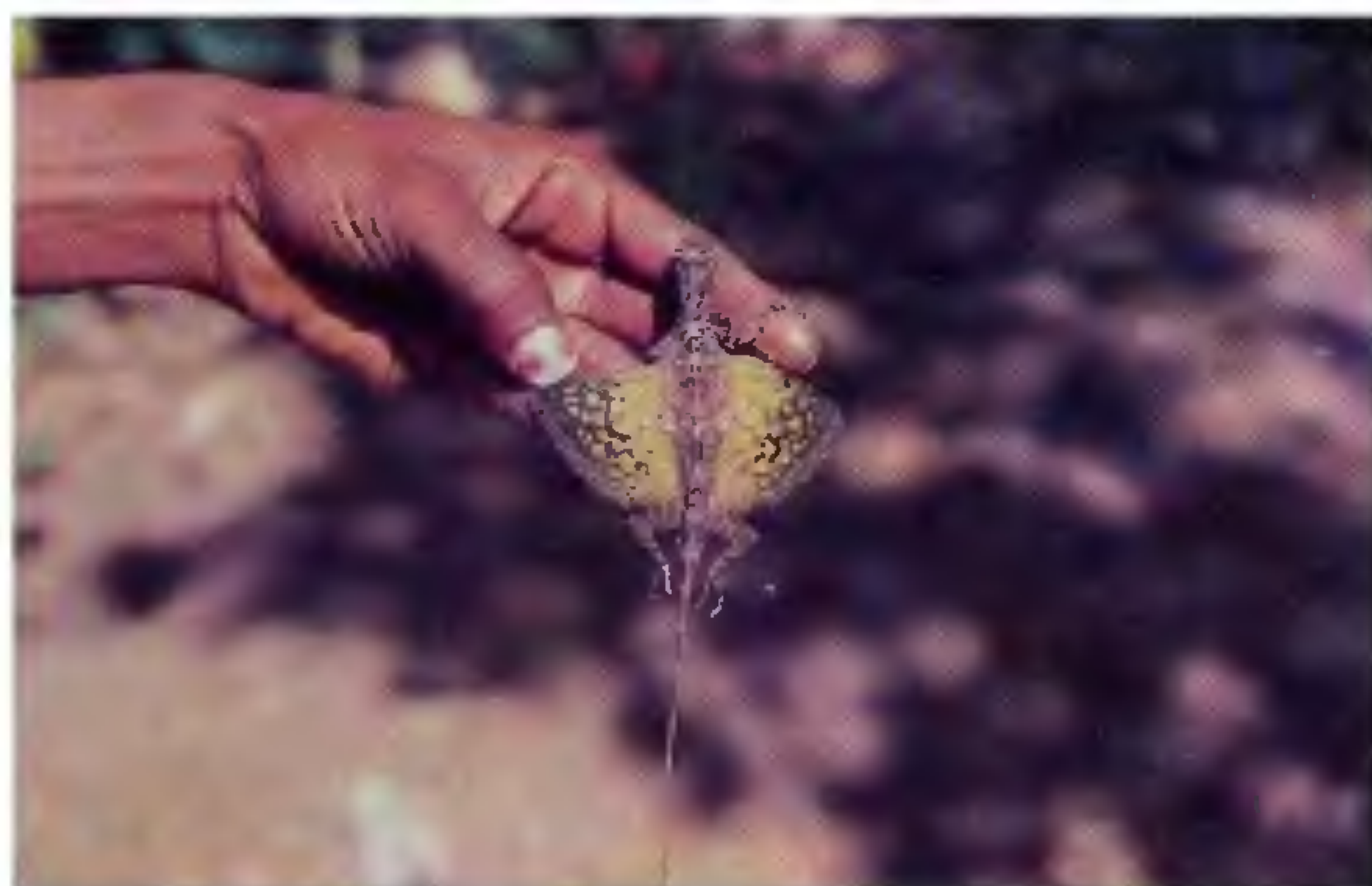
'Draco' – a flying lizard found frequently in the Agastyamalai area. These are being caught and sold in hundreds by greedy specimen collectors.