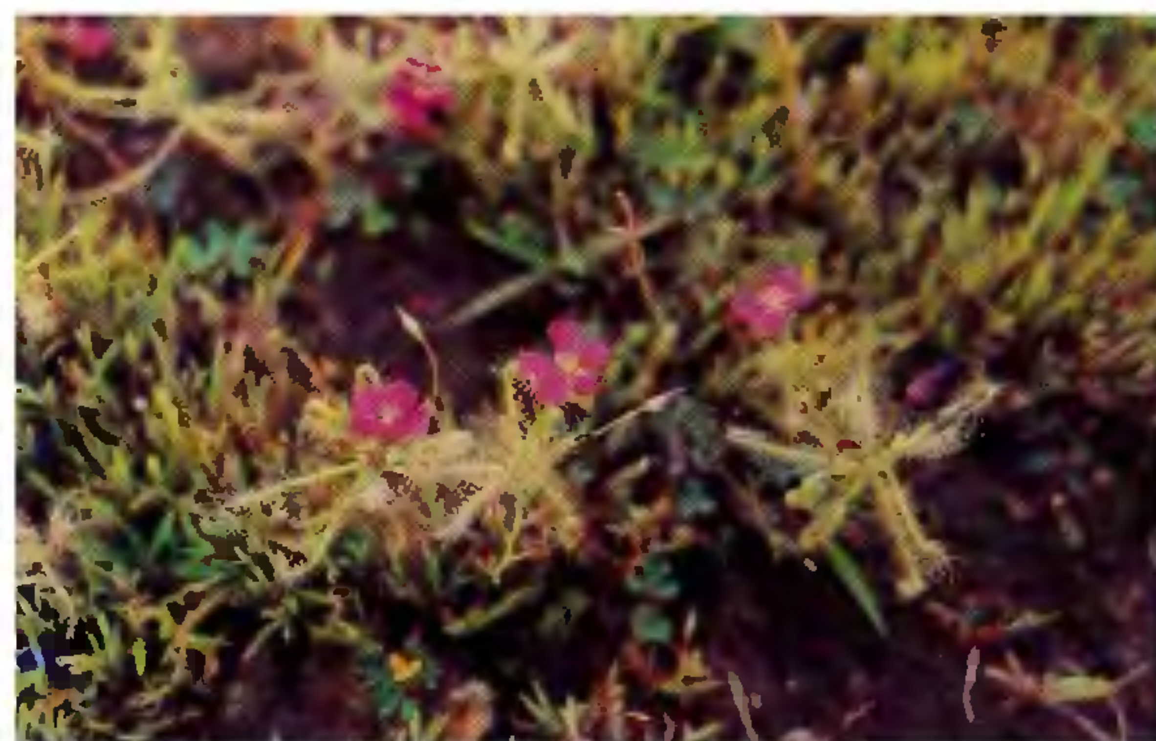
Drosera indica – an insectivorous plant growing during the rainy season along the exposed laterite hills of coastal Uttara Kannada.

commits all parties to the convention to facilitate access to their resources, and in return promises the countries of origin of such resources favourable treatment in terms of transfer of technology and of financial resources. CBD commits countries to prepare proper inventories of their biodiversity resources, to monitor their fate, to organize adequate information systems for such resources, and to take steps to conserve them 12,13 . CBD also recognizes the role of indigenous communities in conservation and sustainable use of biodiversity resources and enjoins member countries to share benefits of utilization of biodiversity resources with these indigenous communities.