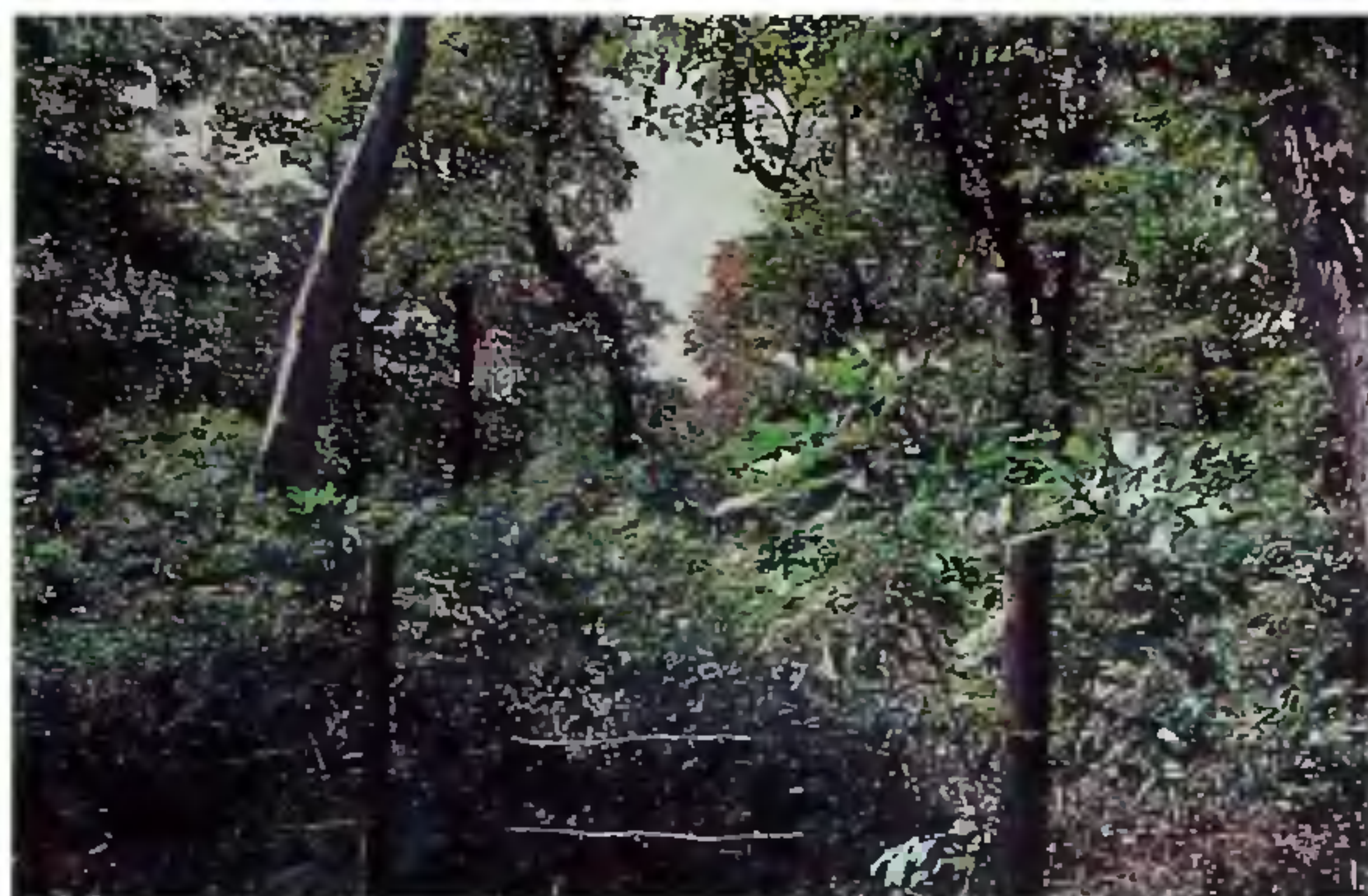
Profuse natural regeneration of Xylia dolabriformis (ironwood tree) in a protected forest planted with exotic Acacia auriculiformis . In most of the Western Ghats tract mere protection by fencing alone is sufficient for rapid regeneration of natural forests.