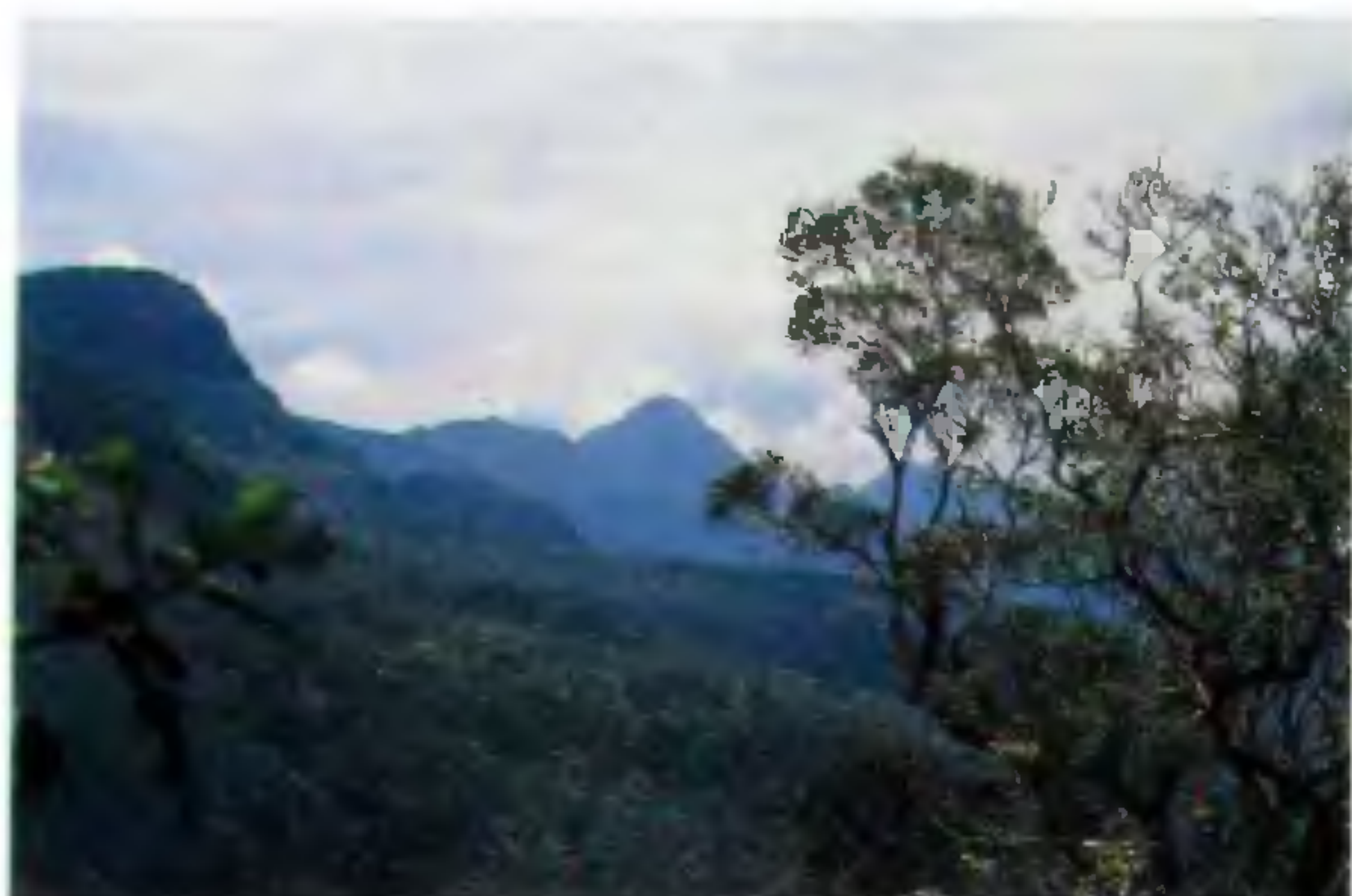
Agasthyamalai – A view of Agasthyamalai hills in Thiruvananthapuram. These hills are known for high levels of biodiversity, a good number of which are endemic to the Western Ghats.