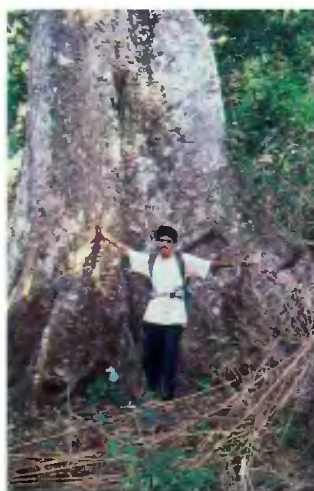
Acrocarpus fraxinifolius – Buttressed base of an immense sized tree Acrocarpus fraxinifolius at Narasimharajapura Range, Chikmagalur district.