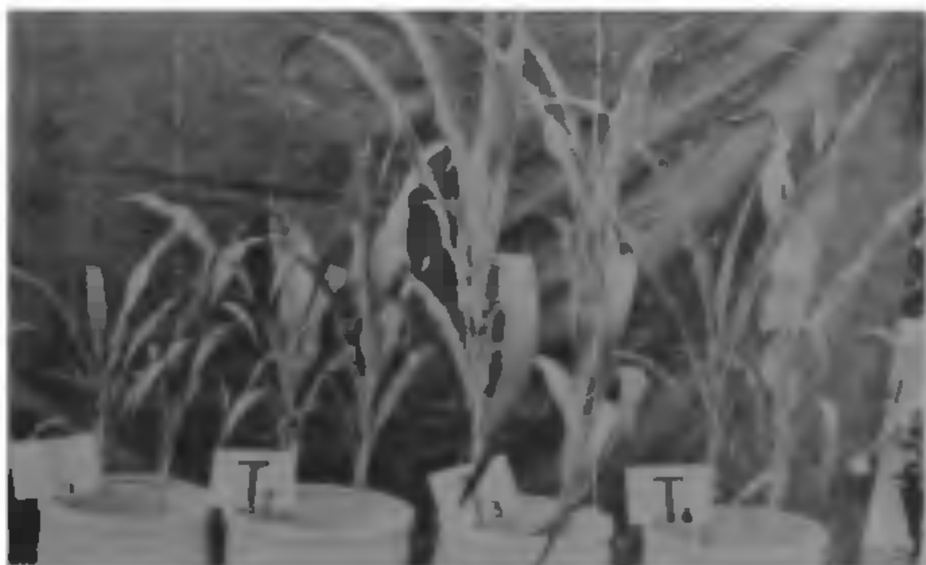
Figure 1. Effect of humic acid on the shoot growth of sorghum.

Higher amounts of ortho-dihydroxy phenols in plants are due to humic acid treatment. According to Schneider and Wightman 9 O-dihydric phenols are reported to retard IAA oxidase activity. The mechanism suggested by them is that the diphenols act as anti oxidants, thereby inducing a lag period in