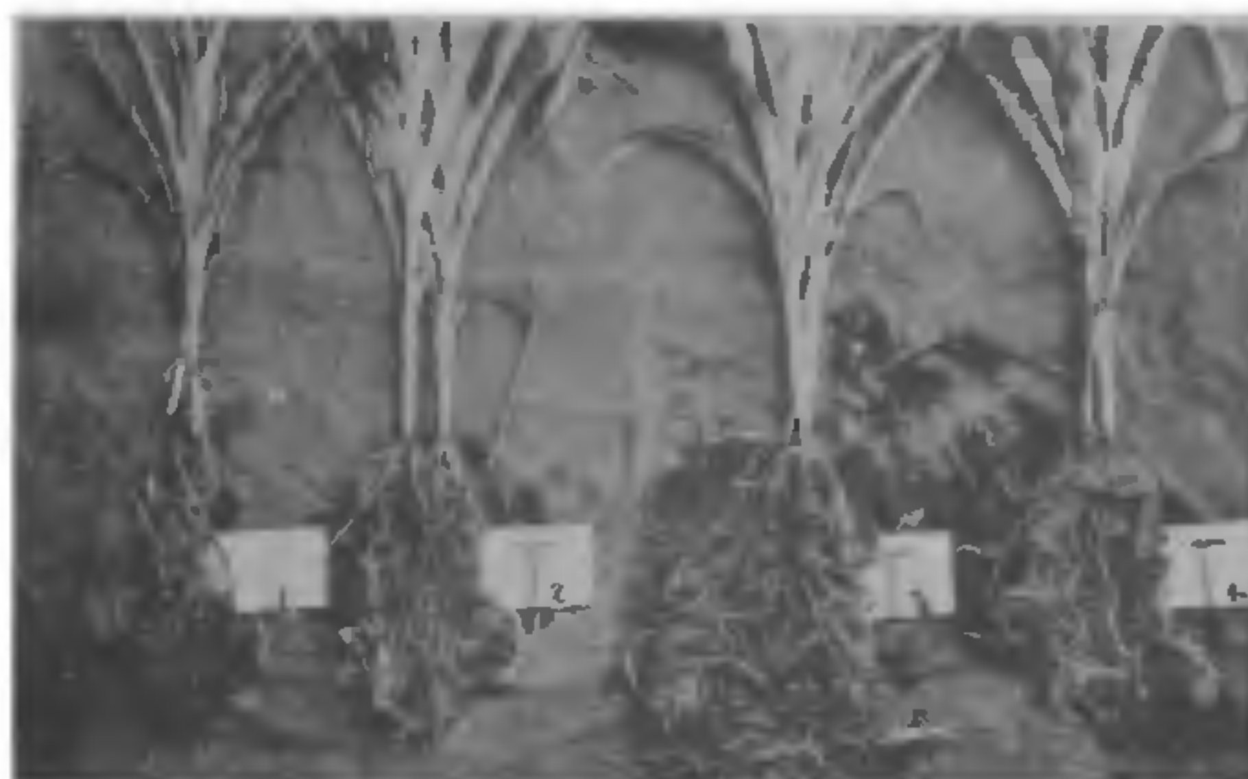
Figure 2. Effect of humic acid on the root growth of sorghum.

Total phenolic contents in sorghum differed significantly with the application of humic acid. Addition of humic acid resulted in a decrease of total phenol in sorghum (figure 3). This decrease in the total phenol content of sorghum due to humic acid was maximum at 30 kg ha -1 level.