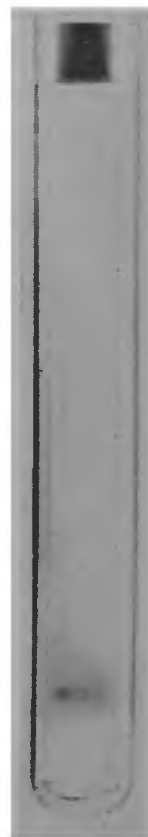
FIG. 2. Polyacrylamide gel electrophoresis of glucoamylase (50 \mu g) from T. lanuginosus in 7% (w/v) gels (anode towards the bottom of the gel). Coomassie Brilliant Blue R was used for protein staining.

The mode of action of purified glucoamylase was studied with maltose, dextrin and soluble starch as substrates. The products of the reaction were identified chromatographically 9 . The enzyme produced only glucose from all the three substrates (Fig. 3) indicating that