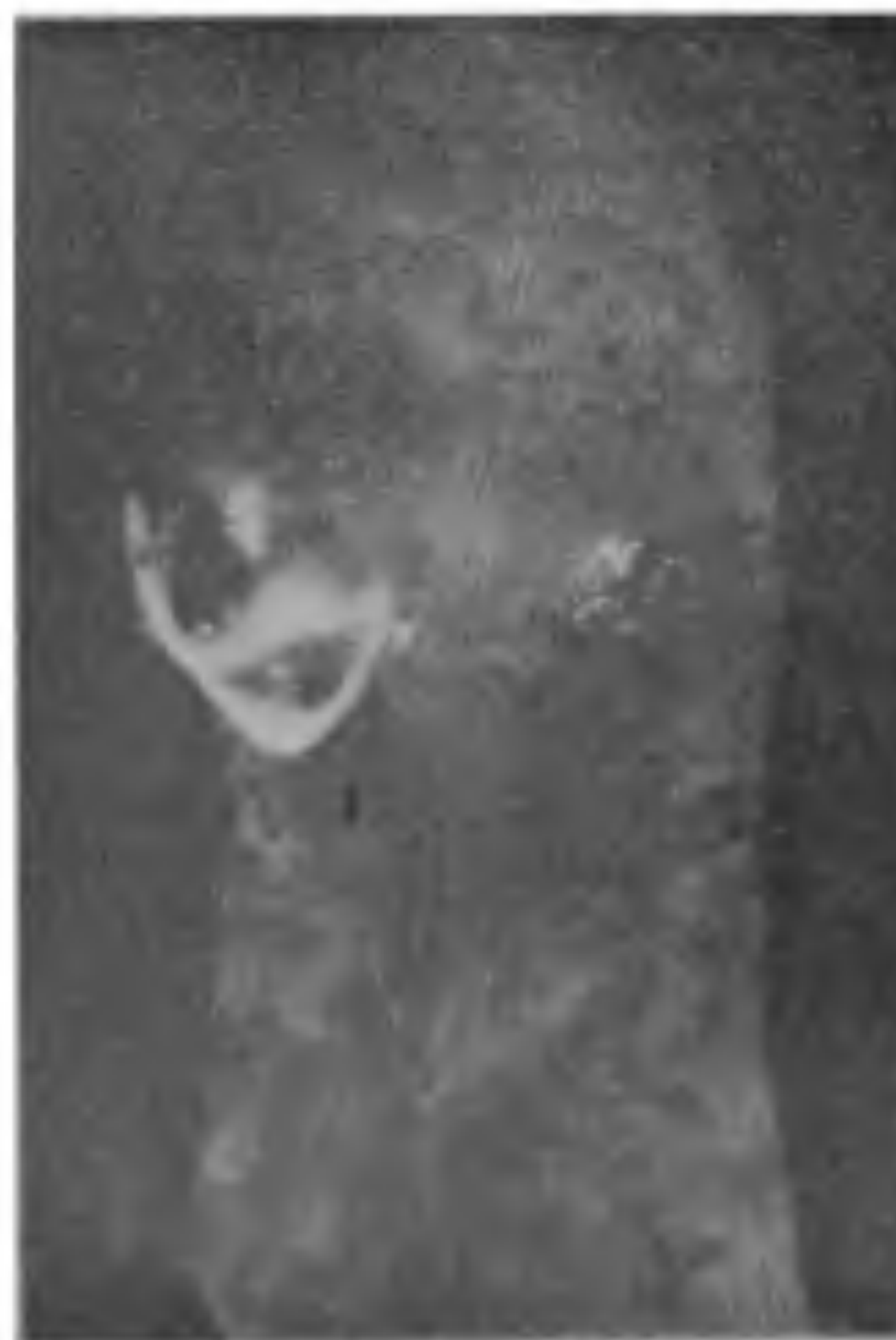
FIG. 1. Beauveria bassiana infected banana leaf beetle on a piece of banana leaf.

DURING April-May 1977, a large number of banana leaf beetle ( Nodostoma subcostatum ) infesting banana in the horticultural orchard, Assam Agricultural University, Jorhat, were found to be infected by a white muscardine fungus causing death of the pests. White frosty growth of the fungus first emerged through the suture of elytra, thoracic segment and ventral side of abdomen of the dead insect which ultimately covered the whole body (Fig. 1). In most of the cases the beetles were fixed on banana leaves by the fungal mass. The fungus was identified as Beauveria bassiana (Bals.) Vuillemin (IMI 215268). The spores are single celled, hyaline, ellipsoidal or oval, 2.5-4.5 \times 1.5-2.4 \mu . Although the ellipsoidal spores have some affinity with B. brongniartii (Sacc.) Petch. clustering of conidiogenous cells is typical of B. bassiana .