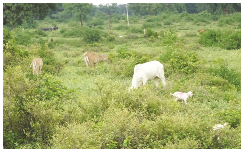
Figure 2. Nilgai grazing along with buffaloes, cows and goats in Dumraon.