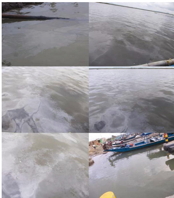
Figure 1. Field photographs of oil pollution in Chilika lagoon.

Petroleum hydrocarbon (PHC) concentration of lagoon water was determined at four sites representing the four sectors of the lagoon (Figure 2). Three samples from each sector were collected during September 2013, analysed for PHC and the averages were considered as the representing concentrations for each sector. The Outer Channel was observed to have the highest PHC concentration (330 µg/l), whereas the Northern Sector had the lowest (50 µg/l) (Figure 2). PHC concentrations from the Central Sector and Southern Sector were 280 µg/l and 130 µg/l respectively. The Outer Channel of Chilika and the Central Sector have a high density of traditional non-motorized fishing and motorized fishing, and are also the centre of tourism activities, which might be the reason for these high PHC values compared to the other sectors. Presently observed values were concomitant with other studies indicating oil pollution due to increase in PHC concentration, viz. in the Arabian Sea (0.6–305 µg/l) 11 , Visakhapatnam Harbour (11.5–123.8 µg/l) 12 , Chennai Harbour