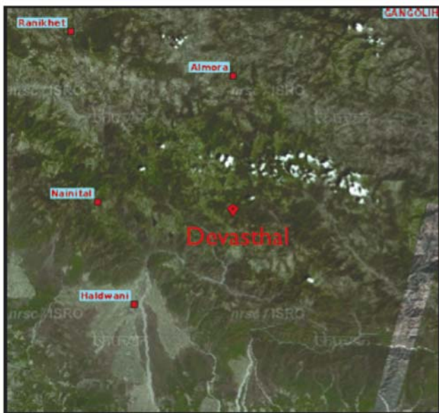
Figure 1. Geographical location of Devasthal in the map of Uttarakhand.

A photograph of the telescope after installation at Devasthal is shown in Figure 2. The tube of the 130-cm telescope is of open truss, allowing the telescope to cool faster in the ambient. The telescope mount is of fork-equatorial-type, which requires only one axis of rotation while tracking celestial sources. The mechanical structure of the telescope is made up of steel and aluminium. There is also a provision through Invar rods and bimetallic materials for automatic compensation of focus variation brought from expansion or contraction of optical tube due to changes in the ambient temperature. The focus can be