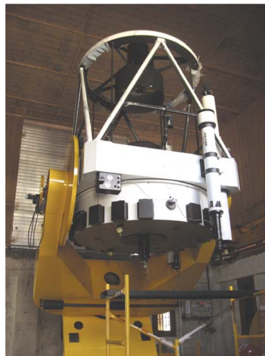
Figure 2. A view of the 130-cm optical telescope installed at Devasthal. The fork structure is painted yellow and the optical tube structure is painted white (outer) and black (inner).