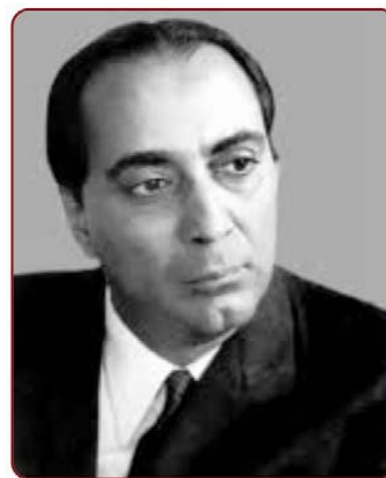
Figure 3. The Bangalore years – the birth of TIFR.

But may be again due to isolation, Bhabha could not contribute to the decisive advances in renormalization theory, which finally made quantum electrodynamics the jewel of physics. The first steps had been taken by Weisskopf in Rochester in 1939, in showing that the divergences were milder in the Dirac electron wave equation framework, and