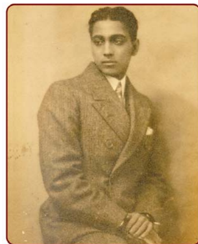
Figure 2. In Cambridge.