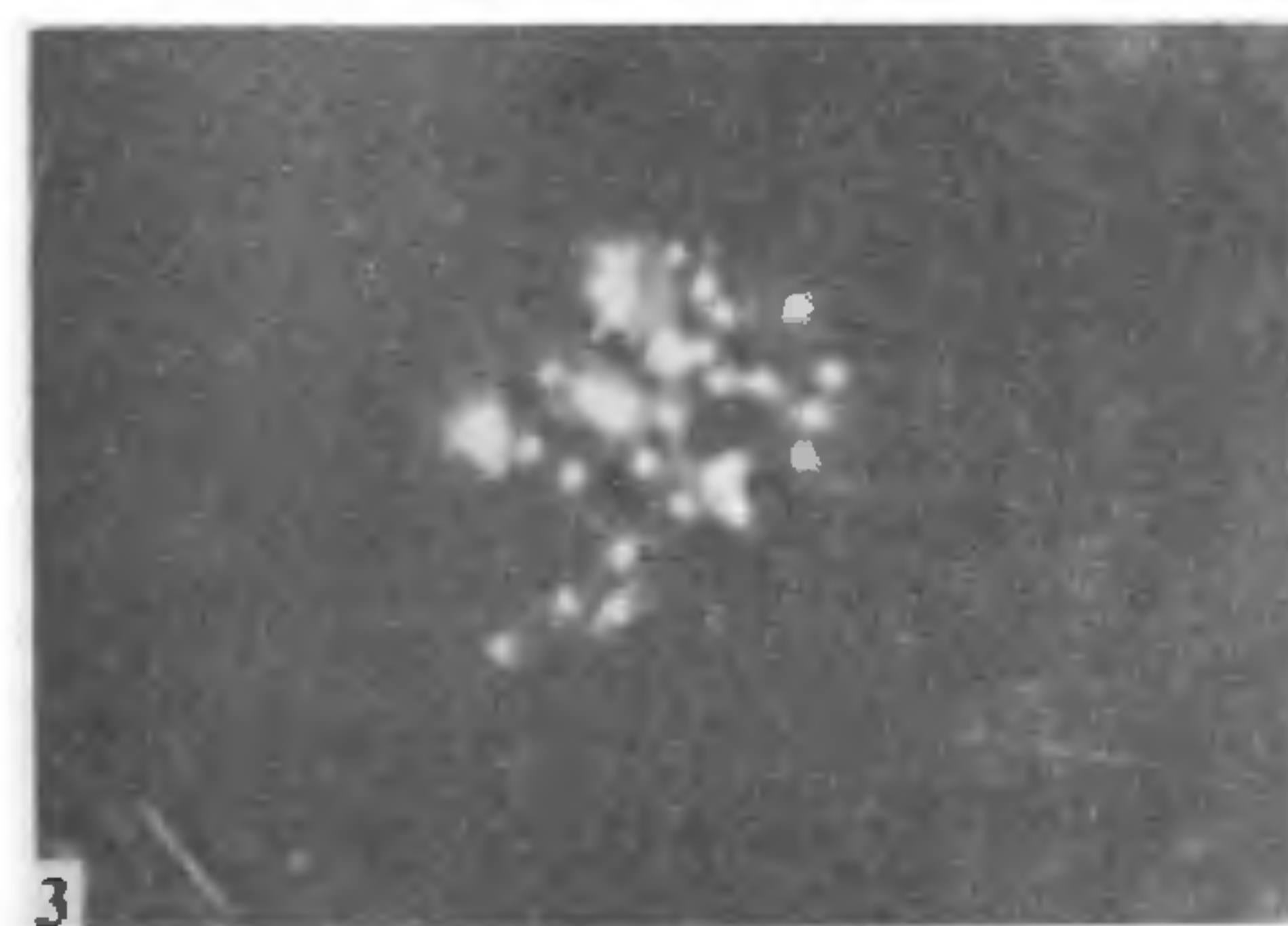
Figures 1–3. Macrobrachium lamarrei H.M. Edw. 1. with infected eggs clasped within the appendages, 2. showing fungal tuft growing out of its abdominal region, 3. showing cottony fungal outgrowths.

as Achlya orion Coker and Couch, Achlya flagellata Coker, Aphanomyces laevis de Bary and Aphanomyces helicoides Minden with the keys 3,4 and the host species was identified by using the key given by Rajyalakshmi 5 .